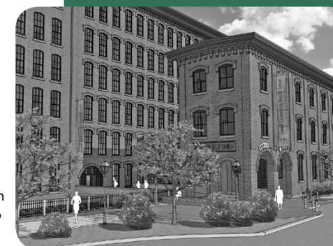
Rendering by Durkee, Brown, Viveiros & Werenfels Architects

As the lead tenant for the Hamilton Crossing adaptive reuse project, LCHC will occupy approximately 100,000 square feet of commercial space.