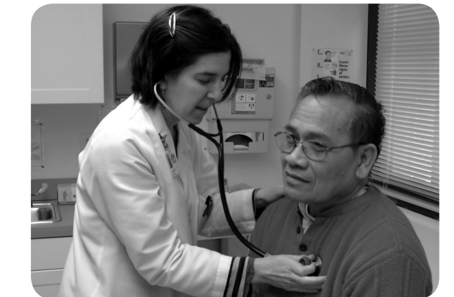
A doctor examines a patient at LCHC's Metta Health Center which specializes in health care for Southeast Asian populations.