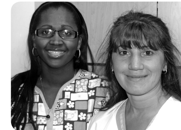
Medical staff from the Health Center's Women's Services department which focuses on women's health and reproductive health issues.